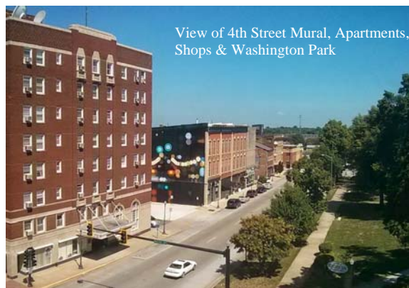
View of 4th Street Mural, Apartments, Shops & Washington Park