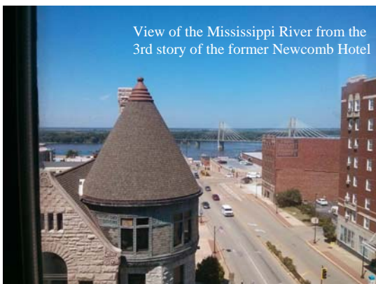
View of the Mississippi River from the 3rd story of the former Newcomb Hotel

Quincy is located in the heart of the Midwest at the center of the tri-state region. With a population of 40,000 people, Quincy is the largest city in a 100-mile radius and the commercial hub for 600,000 people in Western Illinois, Northeast Missouri and Southeast Iowa.