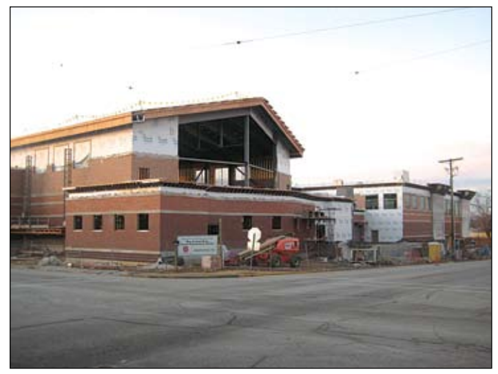
Future site of $20 million Ray and Joan Kroc Community Center located in dowtown Quincy.

oped a downtown business plan that would attract new businesses and restau-